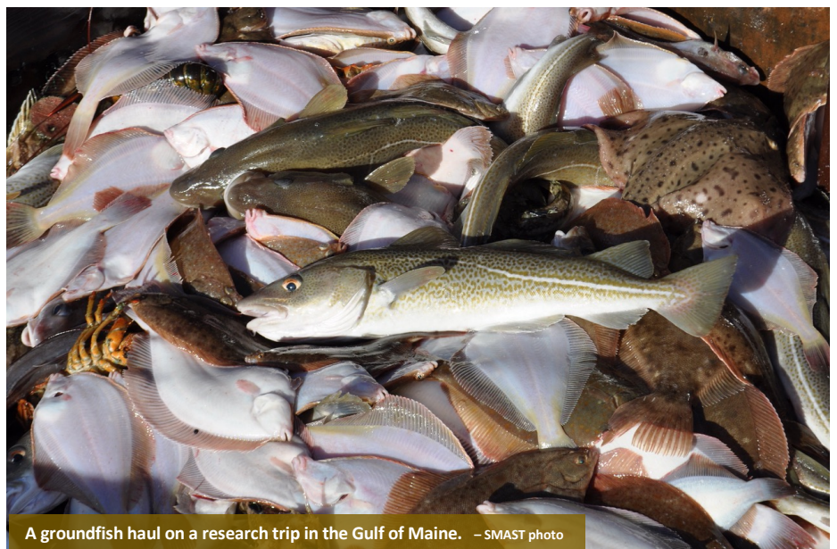
A groundfish haul on a research trip in the Gulf of Maine.

During this meeting, the Council clarified that the framework should consider, among other factors, the challenges identified