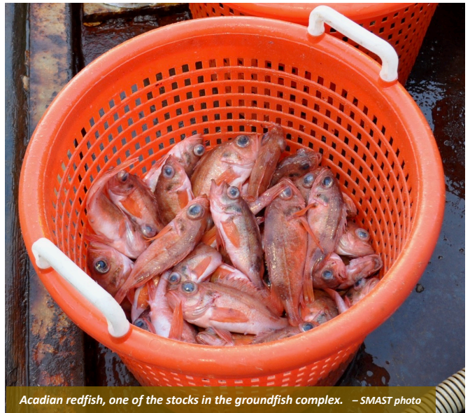
Acadian redfish, one of the stocks in the groundfish complex.

"Conservation and management measures shall prevent overfishing while achieving, on a continuing basis, the optimum yield from each fishery for the United States fishing industry."