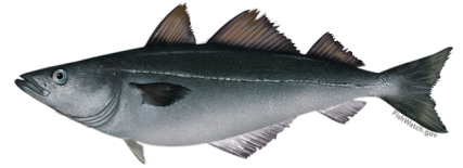
Above, Atlantic pollock. Below, yellowtail flounder.