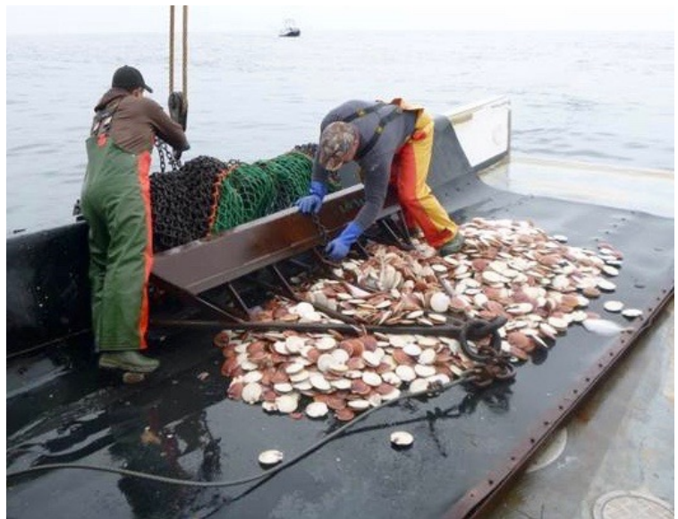
The Northern Gulf of Maine Management Area has been surveyed several years in a row now thanks to the Scallop Research Set-Aside Program.

Amendment 21 also expands the observer call-in requirement so that all scallop vessels operating in the NGOM Management Area, including LAGC Category B vessels, will need to call in before fishing.