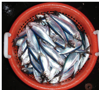
Atlantic herring

Net slippage, according to the Atlantic Herring FMP, is defined as catch that is discarded prior to being observed, sorted, sampled, and/or brought on board the fishing vessel.