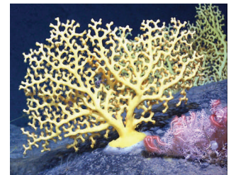
Sea Research Team, 2004; Location, New England Seamount Chain

Mountains in the