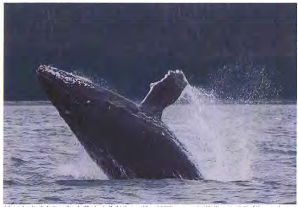
A humpback whale breeches in Alaska. Lethal takes and Level "A" harassment with the potential to injure marine mammals such as whales is a high priority in Alaska Division, as is any violation involving injury or potential injury to people, such as a vessel-whale collision.

We identified our enforcement priorities through a consultative process both within NOAA and with external stakeholders, starting with NOAA's National Enforcement Summit in August 2010. After the summit, NOAA's Office of Law Enforcement and NOAA Office of General Counsel's Enforcement Section reached out to fishery management councils, interstate commissions and others to solicit more input, which helped them establish NOAA's Draft Enforcement Priorities. The draft document was published for 60 days of public comment, during which NOAA's Office of Law Enforcement held seven calls with the public to outline the priorities, answer questions and receive feedback. The suggestions received during the public comment period helped our national directors and Special Agents in Charge hone the priorities into this final document. The priority setting process, including ample opportunities for public input, will be undertaken annually.