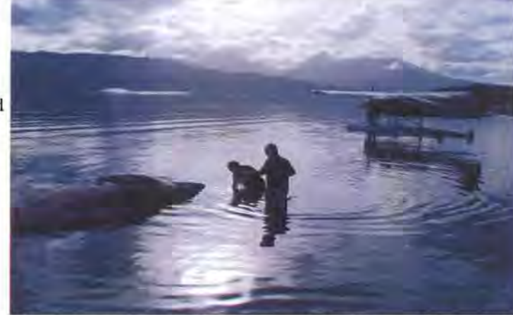
NOAA special agents conduct an investigation under the Marine Mammal Protection Act.