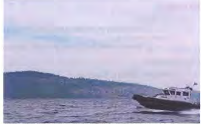
NOAA's Office of Law Enforcement's jurisdiction spans more than 3 million squamiles of open ocean, more than 85,000 miles of U.S. coastline, and all of the country's National Marine Sanctuaries and Marine National Monuments. NOAA's Office of Law Enforcement also is responsible for enforcing U.S. treaties and international law governing the high seas and international trade.

Imported MM parts or products (also Lacey Act).