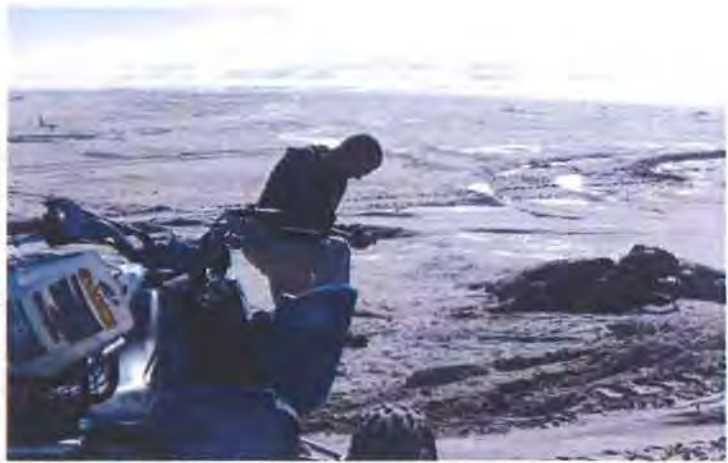
o Commercial vessel incursions into closed A NOAA special agent in the Northwest Division conducts an investigation under the Marine Mammal Protection Act. The lethal, intentional, and/or egregious take of any marine mammal is a high priority for Northwest Division.