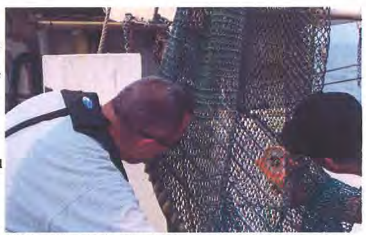
A NOAA special agent and a state partner check the angle of a Turtle Excluder Device. TEDs education and enforcement are a high priority for NOAA's Office of Law Enforcement's Southeast Division.