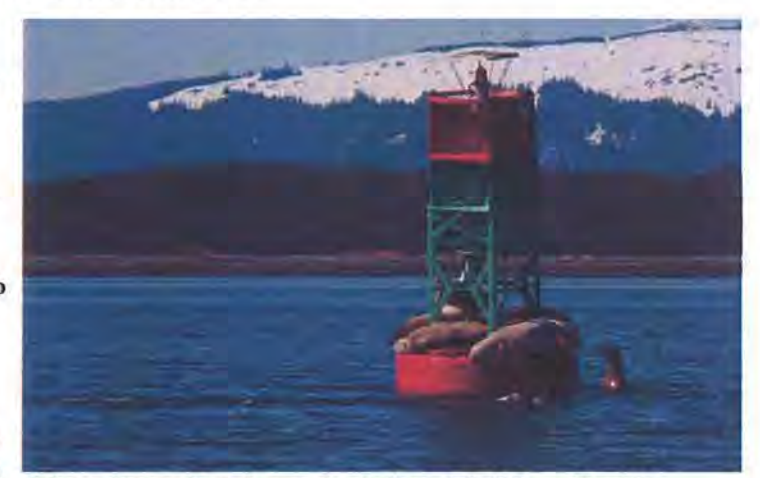
Steller sea lions sun themselves on a buoy in Alaska. Lethal takes and Level "A" harassment with the potential to injure marine mammals such as the Steller sea lion is a high priority for Alaska Division.