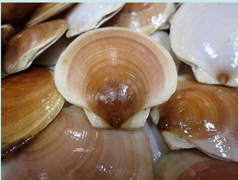
Sea scallops.