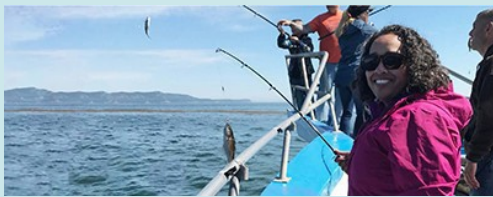
Fishing off a charter boat out of Bar Harbor on Mount Desert Island, Maine. Recreational fishing was one of the ocean activities included in the national survey.

Galimany E, Rose JM, Dixon MS, Alix R, Li Y, Wikfors GH. 2018. Design and Use of an Apparatus for Quantifying Bivalve Suspension Feeding at Sea. J. Visualized Experiments (139), e58213, DOI:10.3791/58213