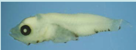
Black sea bass larvae were among the plankton samples collected during the summer Ecosystems Monitoring survey.

Interested in More News From the NEFSC? Check our website , follow us on Facebook and Twitter , and read the NEFSC Field Fresh Science Blog .