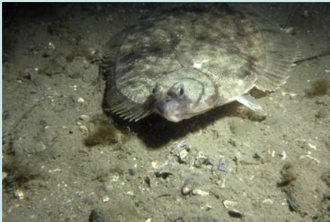
Winter flounder in Narragansett Bay, RI.