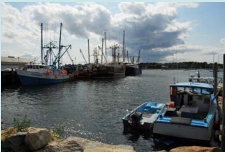
Part of the fishing fleet in port in Stonington, CT.

Northeast Aquaculture Conference & Exposition/Milford Aquaculture Seminar Boston, MA