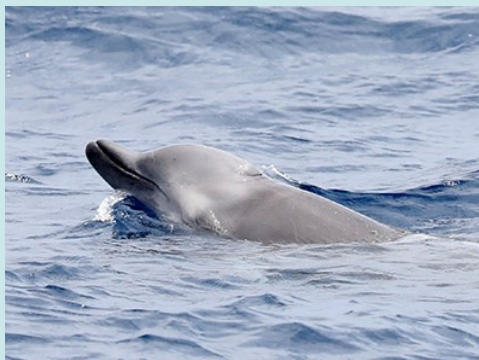
A True's beaked whale on the surface. This elusive deep-diving whale was acoustically recorded and tagged for the first time during an August 2018 NEFSC cruise.