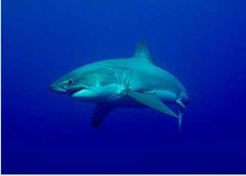
White sharks ( Carcharodon carcharias) are distributed but uncommon along the East Coast from Newfoundland and the Gulf of St. Lawrence in Canada to Florida, Cuba, the Bahamas and the Gulf of Mexico. They can grow to about 21 feet in length.