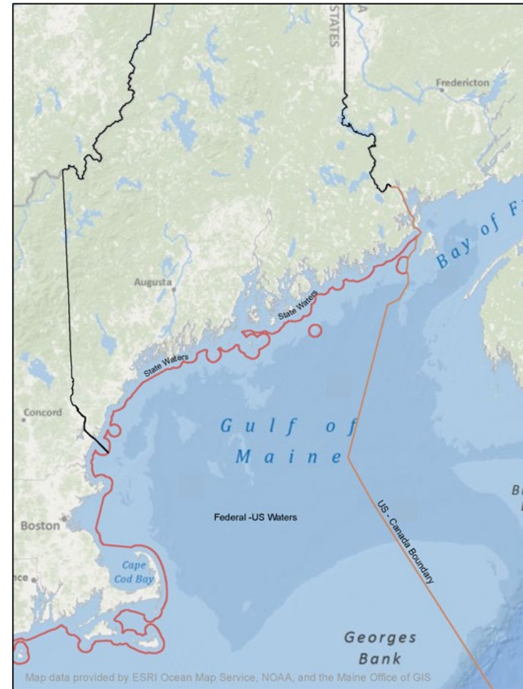
Maine Sea Grant